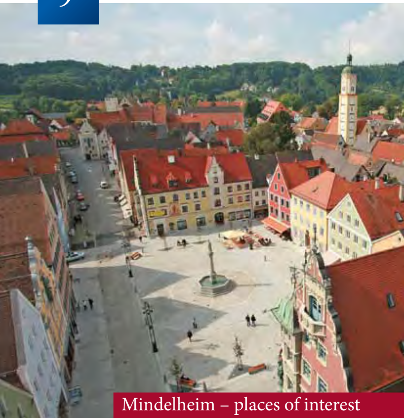
Mindelheim – places of interest